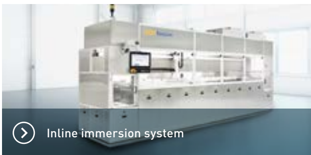
Inline immersion system