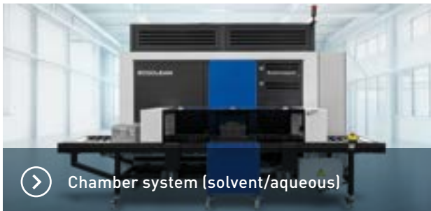
Chamber system (solvent/aqueous)