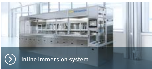
Inline immersion system